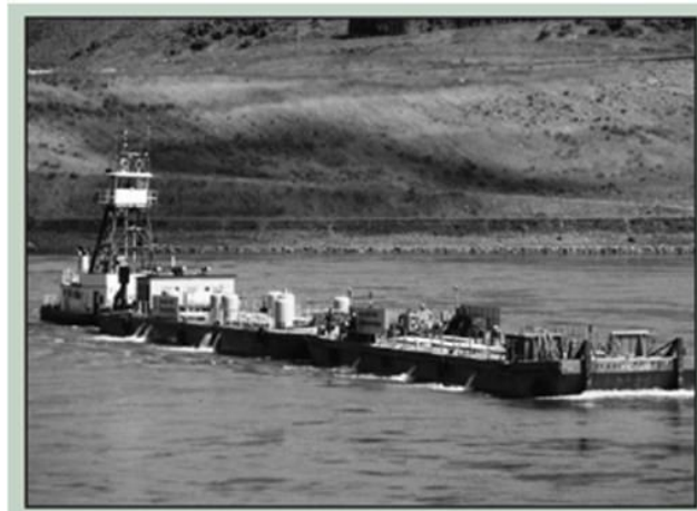
Bonneville's and the Corps' preferred method of downstream salmon migration.

The Corps and Bonneville have wasted billions of taxpayers and ratepayers dollars on a variety of Rube Goldberg schemes trying to save the dams from the law. It was like taping butterfly wings on pyramids hoping to make them fly. All those billions failed to overcome the deadly effects of the Corps' negligence in failing to design the dams to provide safe passage for salmon as required by law.